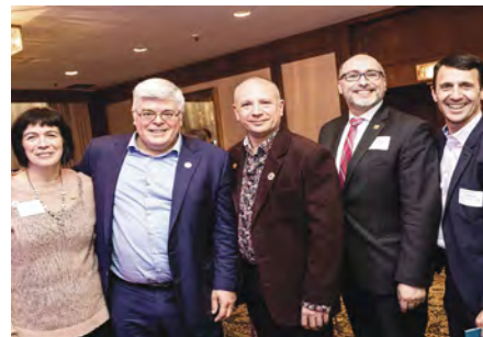
Casino de Montréal and Loto-Québec January 2020