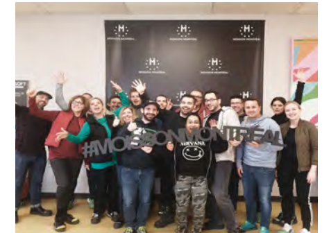
Desjardins October 2019

Centre François-Michelle CRDITED (Centre de réadaptation en déficience intellectuelle et en troubles envahissants du développement) Desjardins