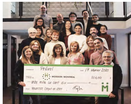
Prével February 2020