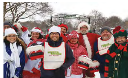
La Fabrique de la paroisse Notre-Dame de Montréal (Media Food Drive December 2019)