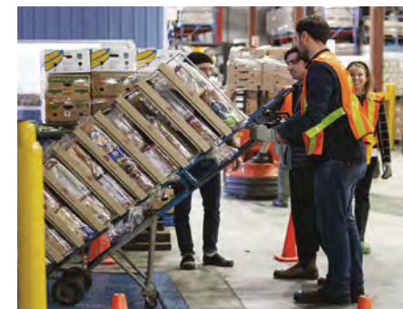
Boulangerie St-Méthode November 2019